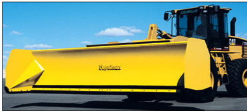
Strongbox Snow Pusher

Ellis Equipment is your Degelman sales rep, not a distributor. Dealers will be invoiced by Degelman.