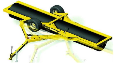
20-Foot Roller w/Pivot Tongue