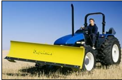
Model 3500 Dozer

Ellis Equipment is your Degelman sales rep, not a distributor. Dealers will be invoiced by Degelman.