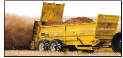
M34 Manure Spreader