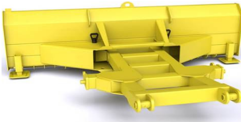
Model 6600, Manual Angle

Ellis Equipment is your Degelman sales rep, not a distributor. Dealers will be invoiced by Degelman.