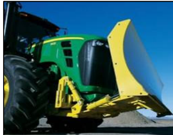
Model 6900, Hydr Angle