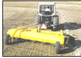
RR1500 Rock Rake