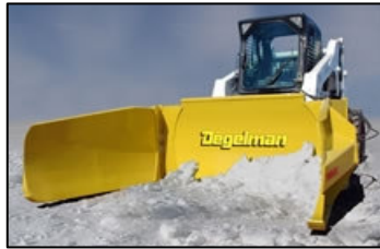
Skid Steer SpeedBlade