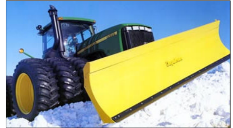
Model 7200, Hydr Angle & Tilt