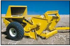
7200HD Rock Picker

Ellis Equipment is your Degelman sales rep, not a distributor. Dealers will be invoiced by Degelman.