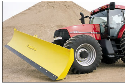
Model 5900 Dozer