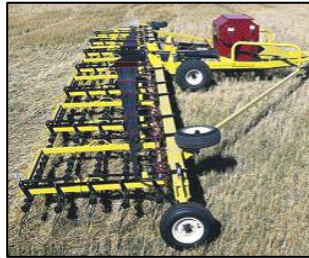
Strawmaster Heavy Harrow