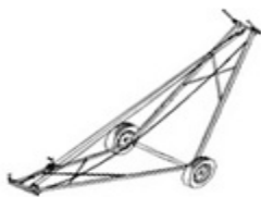
HST-10T + tires