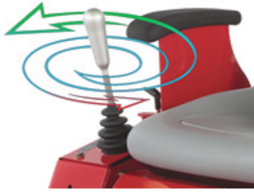
Exclusive Joystick Control (standard)