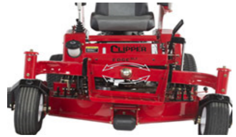
Comfort Ride Pivoting Deck (standard on XLT)