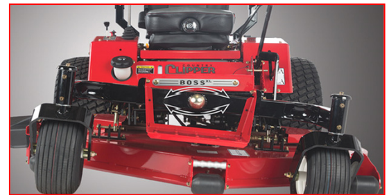
Boss XL, Comfort Ride Pivoting Deck (standard)

FREIGHT: Single unit to the local dealer, $200 each. 5 Units - FREE FREIGHT. ASSEMBLY: 1 hour to uncrate, assemble and prep WARRANTY, RES: 2 yrs preapproved parts/labor, 3 yrs parts, 5 yrs frame (XLT only); commercial 60 days; rental none; with limits. WARRANTY, COMM: 2 yrs preapproved parts/labor, 3 yrs spindles only, 5 yrs frame; rental no warranty; with limitations. WARRANTY on ENGINE, TRANSMISSION, BATTERY is from those manufacturers, with their terms, not from Country Clipper. All orders are also subject to the dealer Sales & Security Agreement, our latest Discounts and Terms, and credit approval.