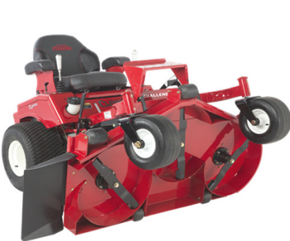
Challenger Easy-Service Deck (standard)