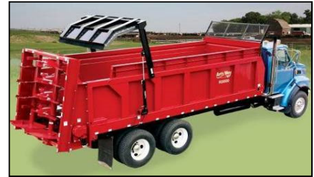
HV220 Truck Mount