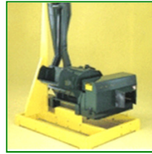
26" Hammer Mill