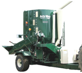
6530 Mixer + Auger Feeder