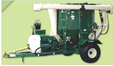
6140 Mixer + Auger Feeder