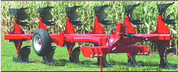
166 Rollover Plow