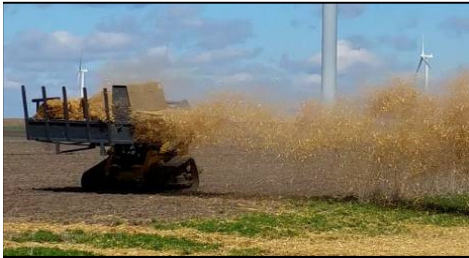
864 Top Spread