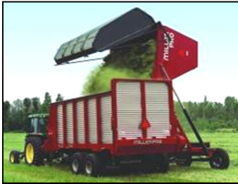
Receiver Box & High Dump Box