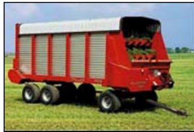
Model 5300 Front Unload + Wagon