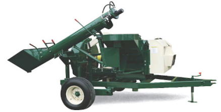
26" Hammer Blower + Feeder