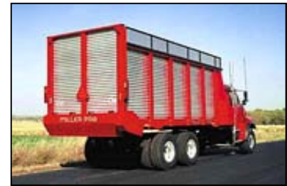
Model 5300 Rear Unload + Truck