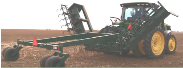
V2400 Land Plane + Dual Wheels + S-Tine