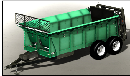
X900 Tandem Axle